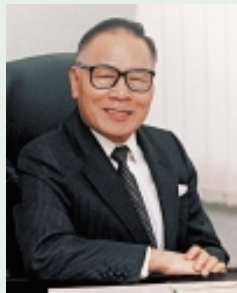
Dr the Hon Sze-Yuen CHUNG, GBM, JP Pro-Chancellor of HKUST

" I am very pleased and proud to celebrate with the University community the crowning achievements of HKUST over the past decade.