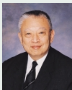
The Hon Tung Chee Hwa Chief Executive of HKSAR University Chancellor

“ Congratulations on HKUST's 10th anniversary!